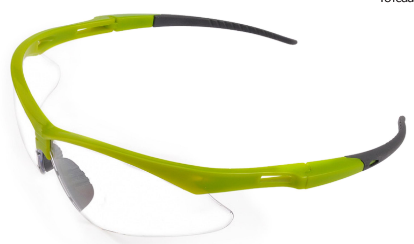
Soft Nose Tips •Toreduceslide